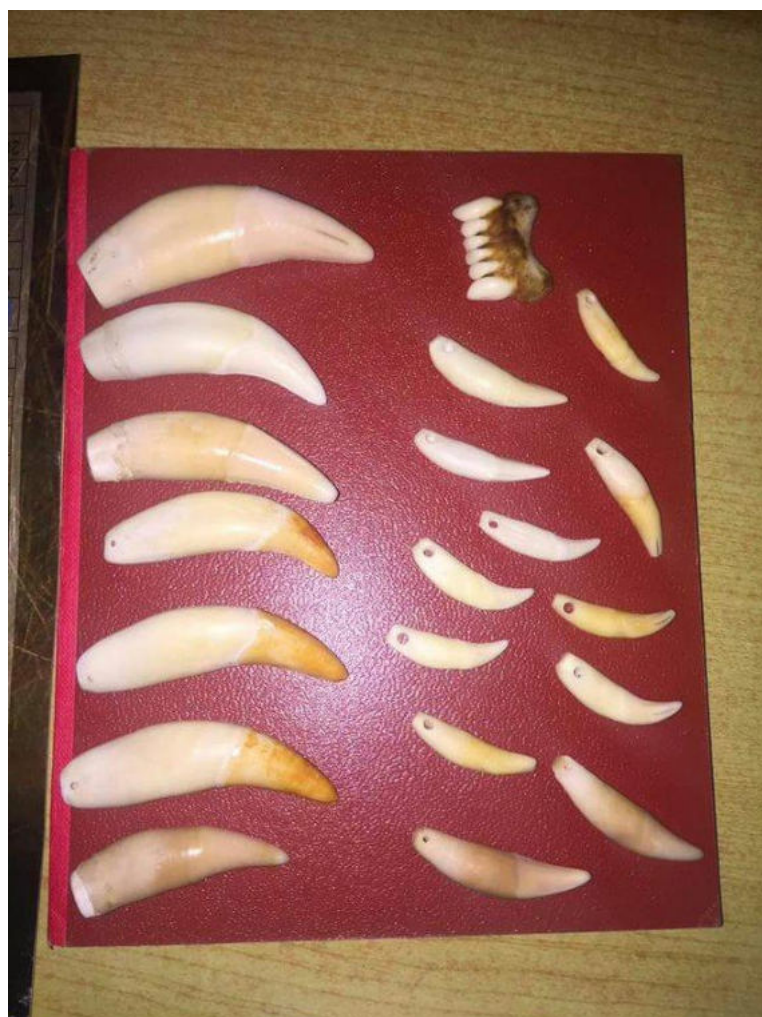
Image right: Jewellery trade: Jaguar body parts are mostly used for traditional Asian medicine, but their teeth and claws are often sold separately in Suriname jewellery shops.