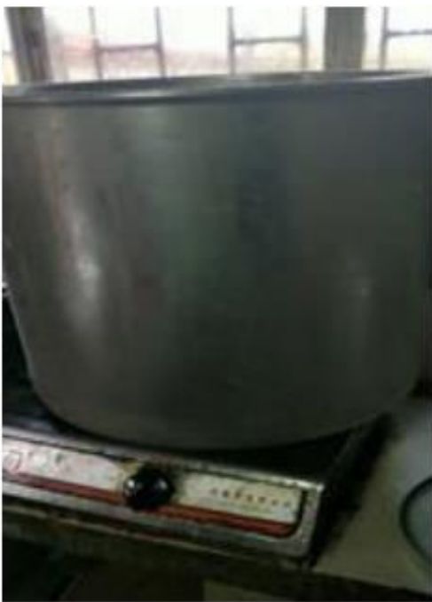
Image: Processing pot: Through a boiling and cooking process, which lasts for up to seven days, jaguar carcasses are turned into a paste highly sought after for traditional Asian medicine.