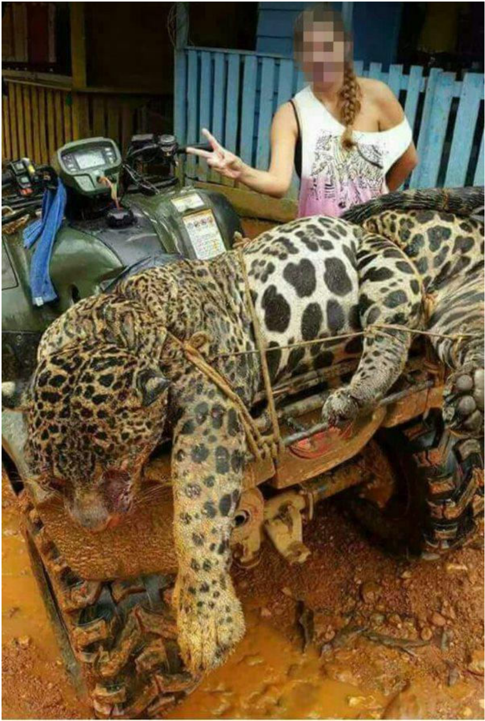
Image: Hunted trophy: A jaguar shot by a gold miner for Chinese clients in February 2018. The jaguar was killed in Suriname near the French Guiana border.

These animals are fed inappropriate diets — cows' milk and sugar water when very young — and kept in cages until they become too big and dangerous to their owners. At this point they may be killed and their body parts sold into the traditional Asian medicine trade.