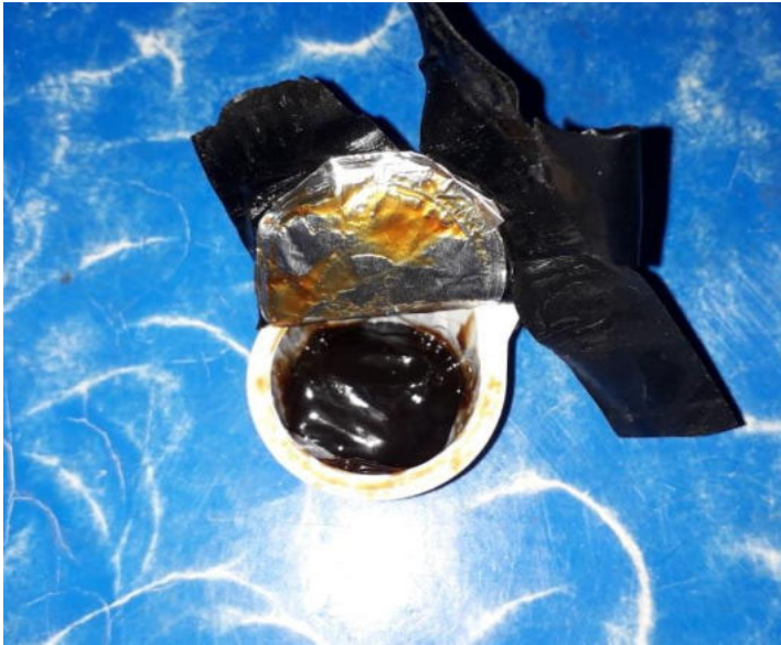
Image: Paste package – the paste like this from jaguar carcasses, is packaged into tubs which can then be transported illegally to China and sold with a high mark-up.