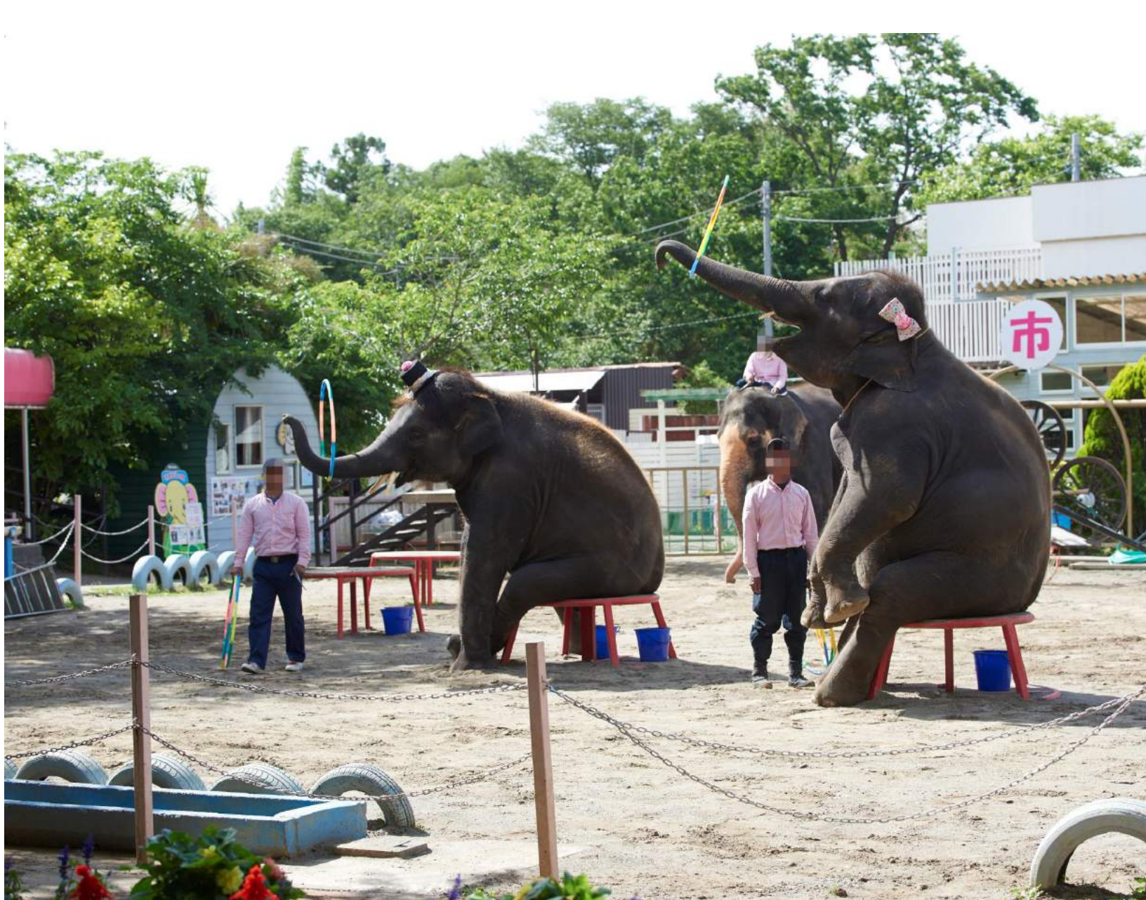
Photo: Ichihara Elephant Kingdom (Japan).